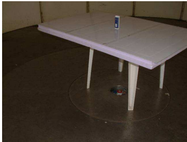
Measurements below 1GHz