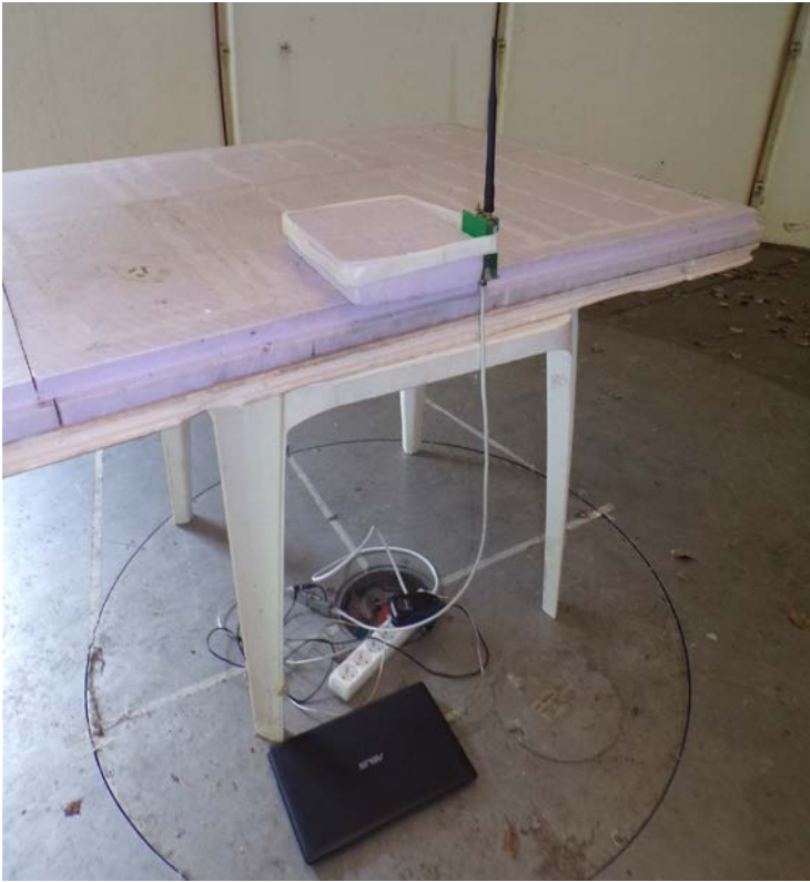
Radiated emission below 1GHz (Antenna type 1-Dipole)