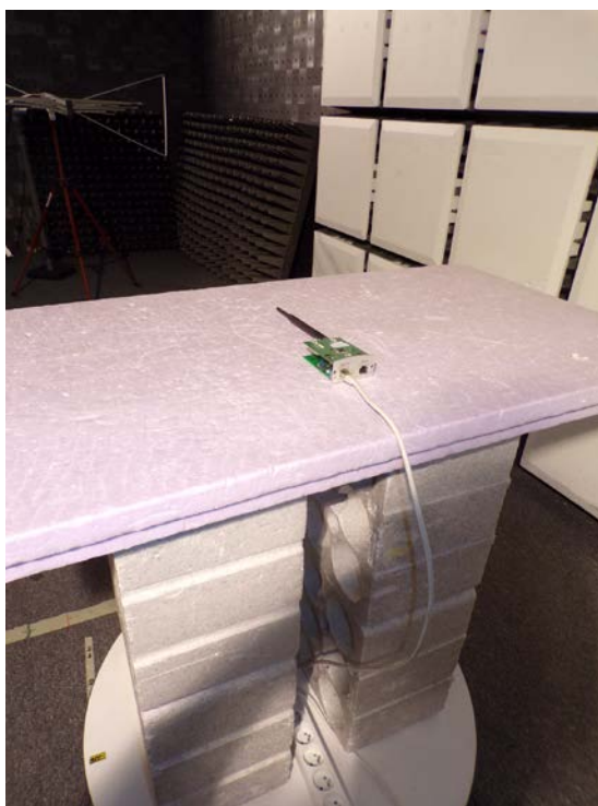
Radiated emission below 1GHz