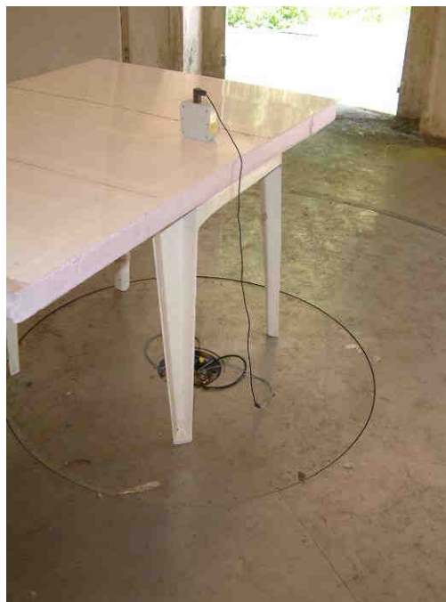
Measurements below 1GHz