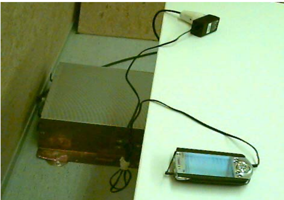
EUT installed in Compaq iPAQ Expansion Pack powered by the supplied AC adapter