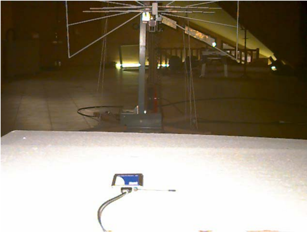
EUT connected via the RS232 port to a remotely operated laptop PC