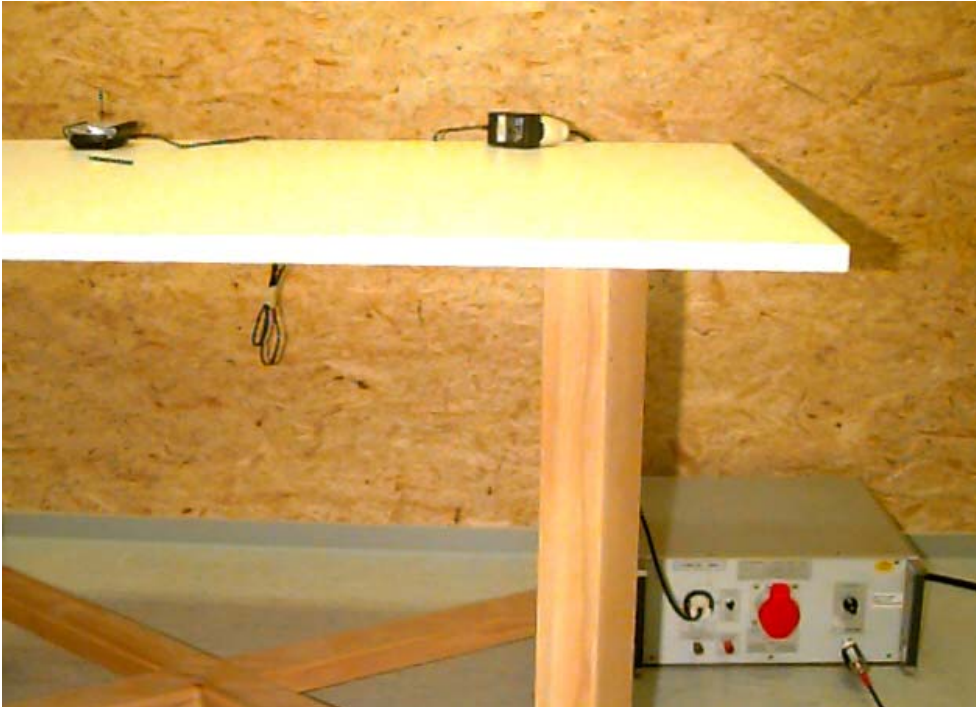
EUT installed in Compaq iPAQ Expansion Pack powered by the supplied AC adapter