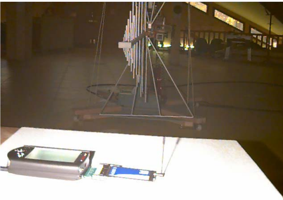
EUT with PCMCIA-Card Extender installed in Compaq iPAQ Expansion Pack