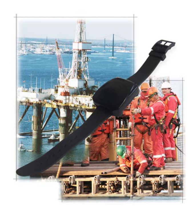
i-B2X W, Wristband Tag Manual