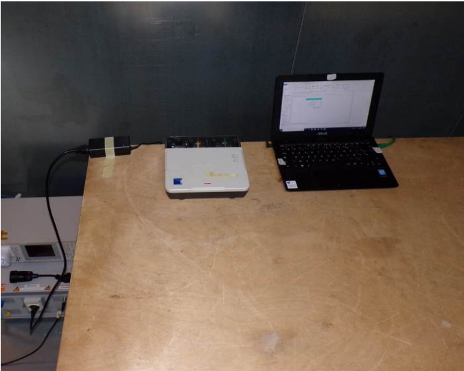
Ethernet + External 24V DC