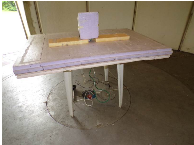
Open Aera Test Site