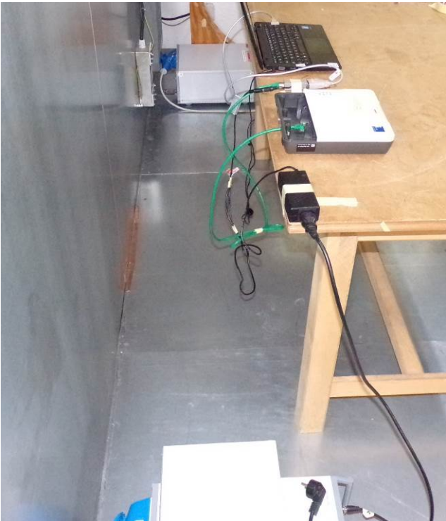
RS422 + 24V mode