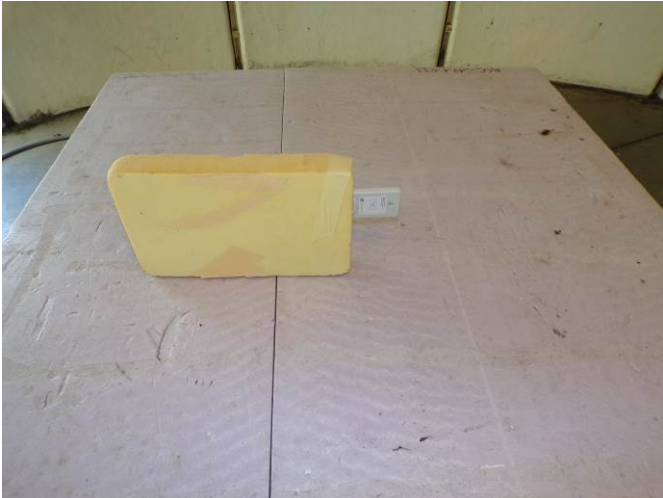
Open Area Test Site