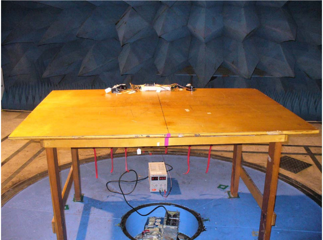
Figure 1: Radiated Emissions – Front View (EUT Flat)