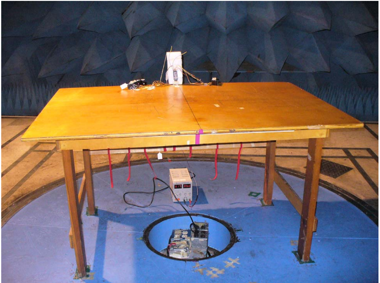
Figure 3: Radiated Emissions – Front View (EUT Standing)