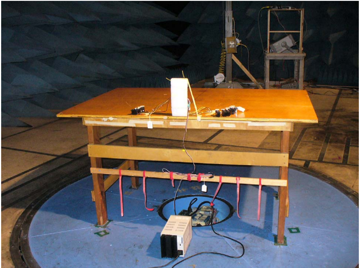
Figure 4: Radiated Emissions – Back View (EUT Standing)