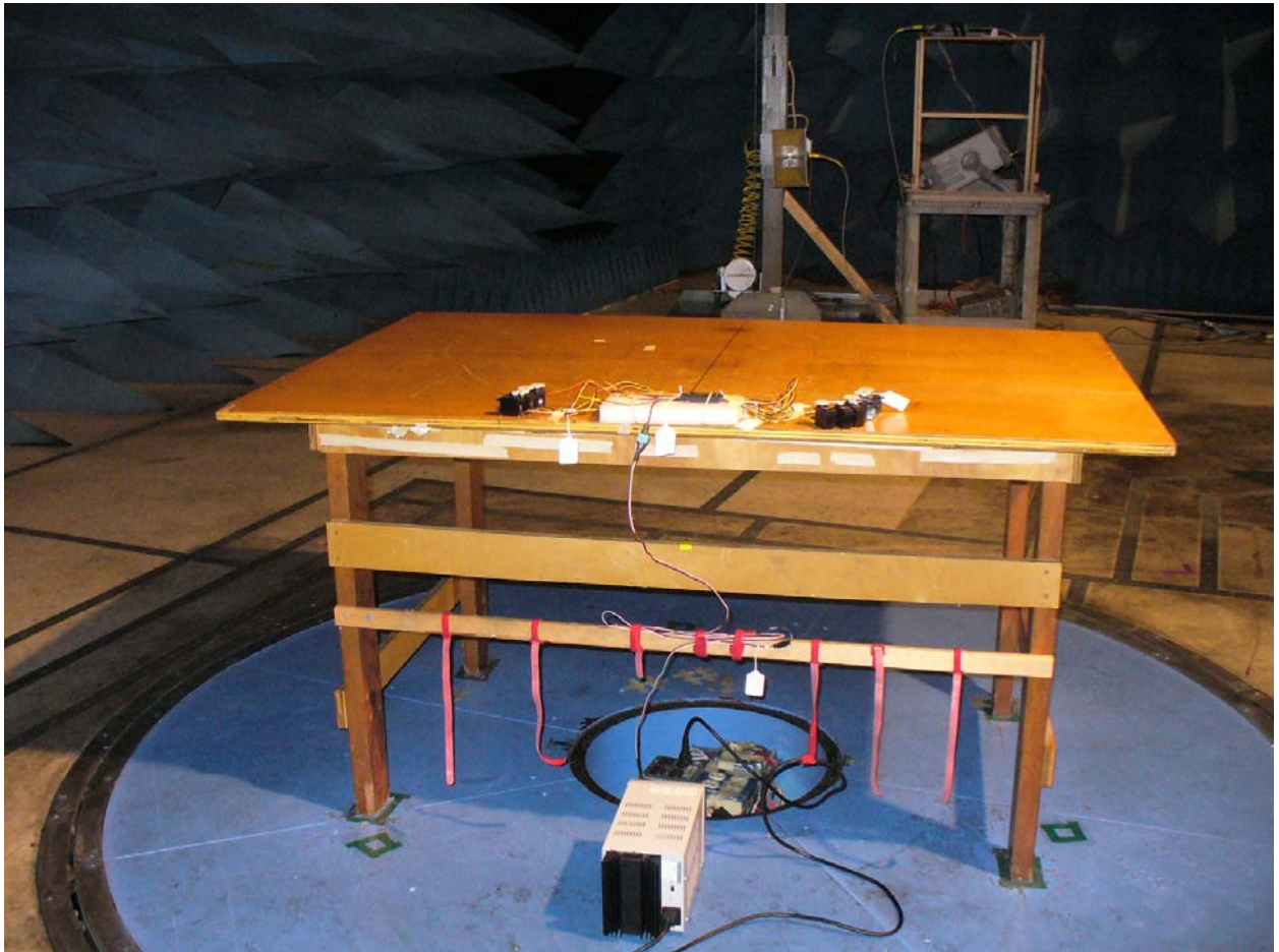
Figure 2: Radiated Emissions – Back View (EUT Flat)