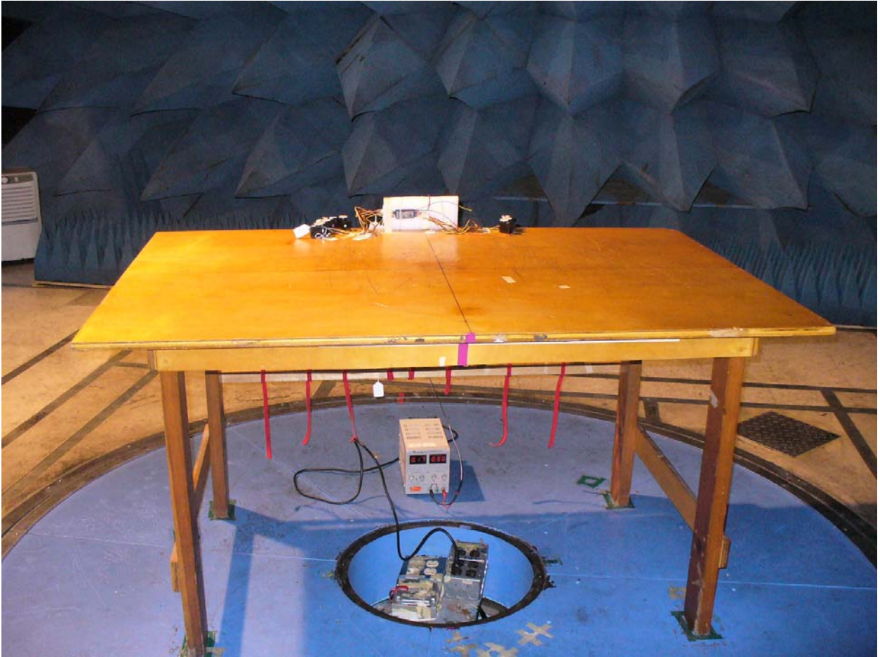
Figure 5: Radiated Emissions – Front View (EUT Side)