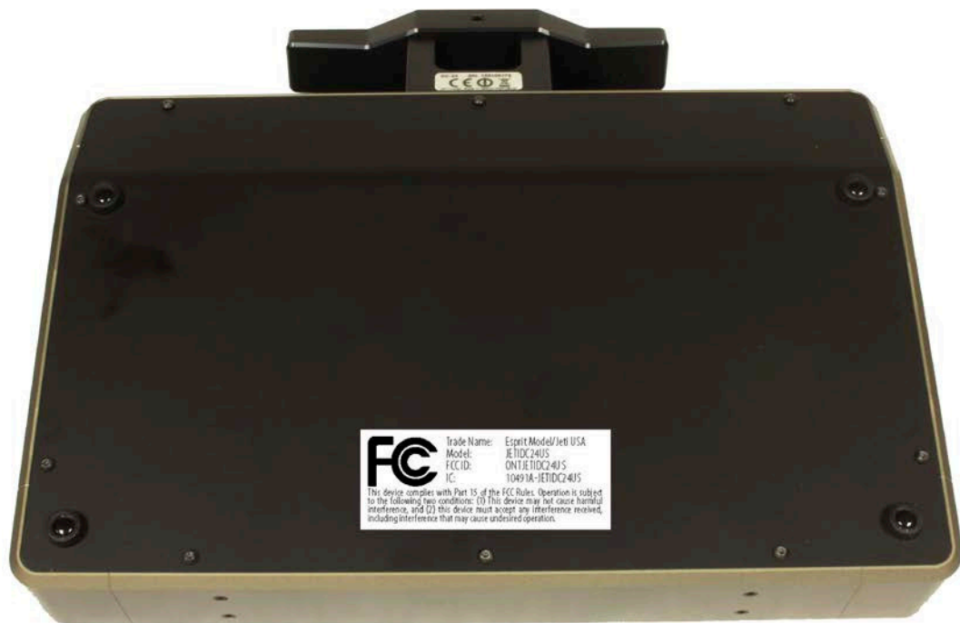
Figure 2: Sample Label Location