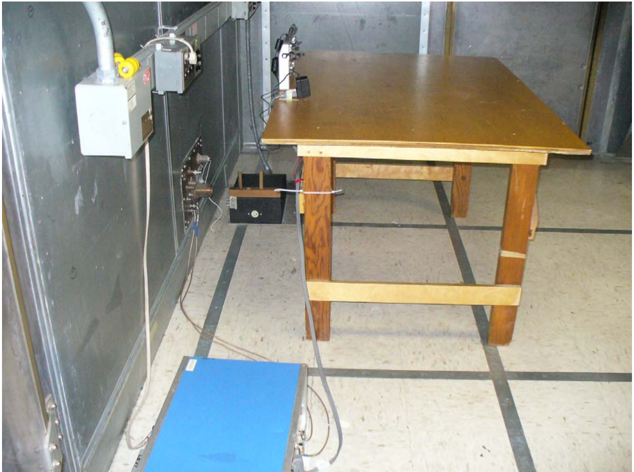
Figure 5: Power Line Conducted Emissions – Side View