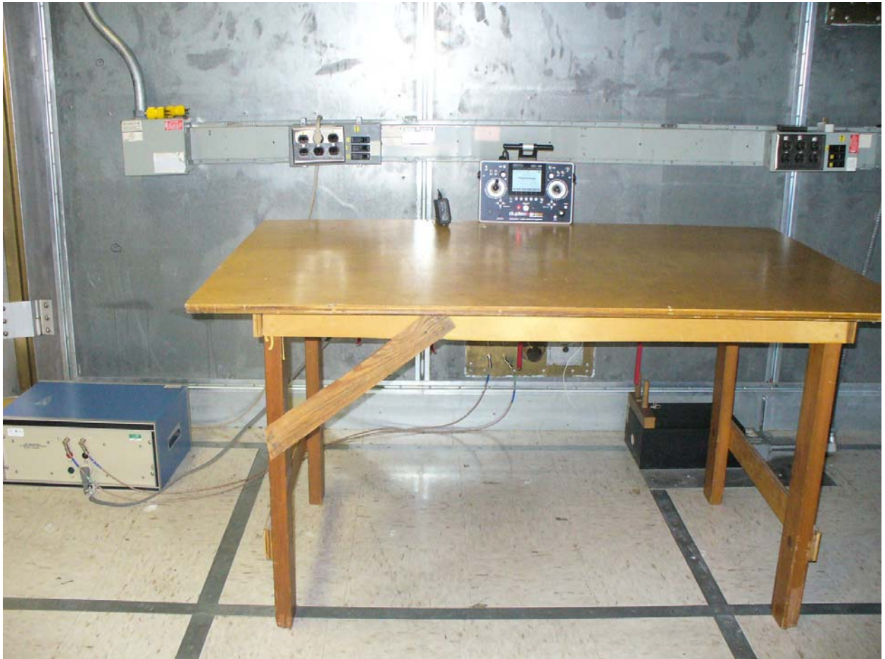
Figure 4: Power Line Conducted Emissions – Front View