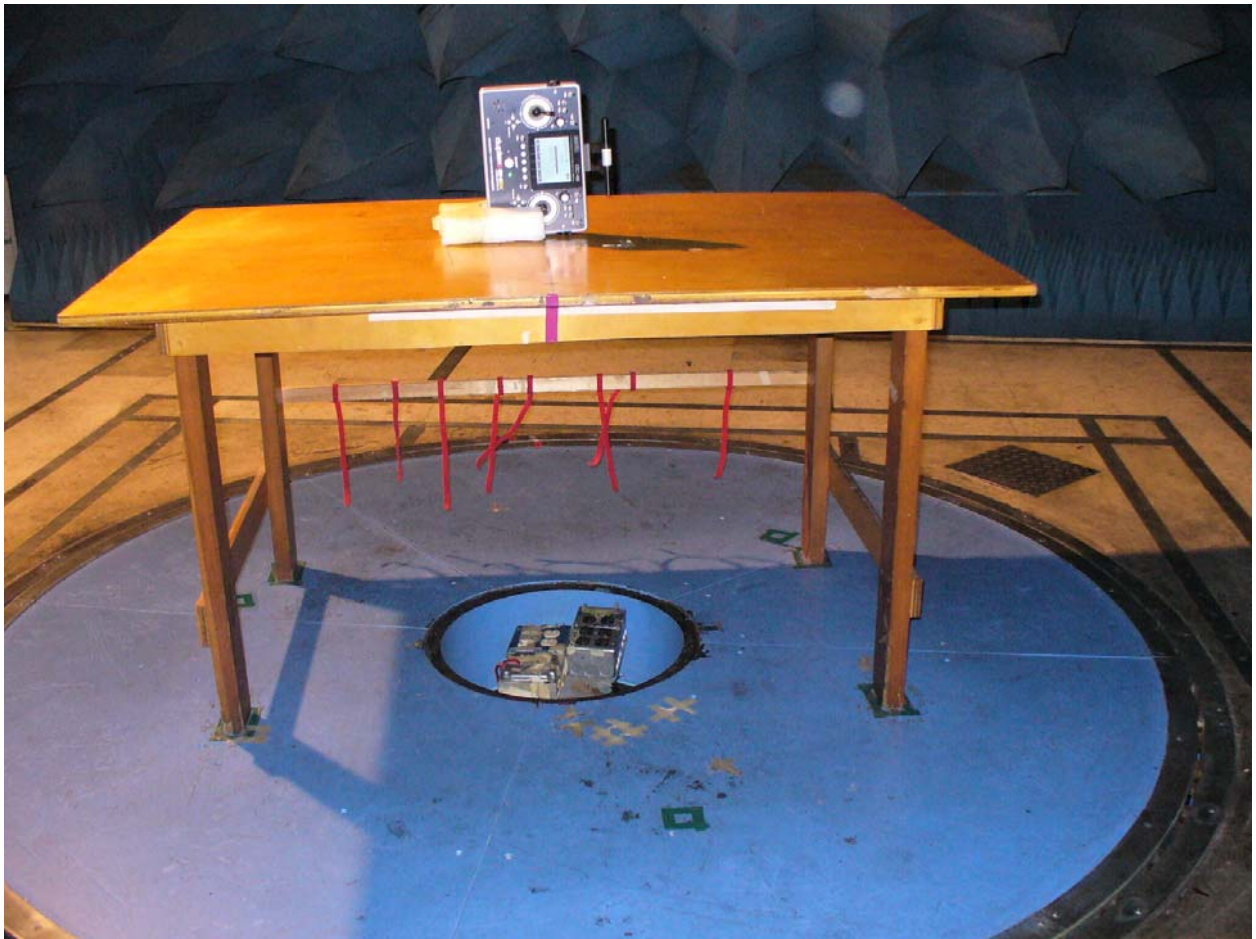
Figure 1: Radiated Emissions – Front View