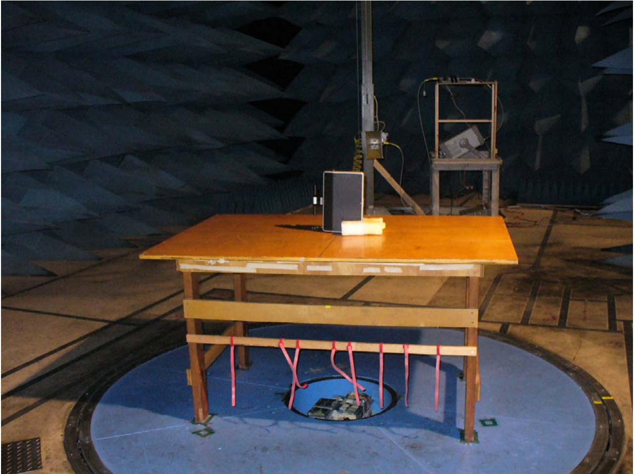
Figure 2: Radiated Emissions – Back View