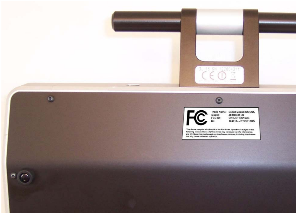
Figure 2: Sample Label Location