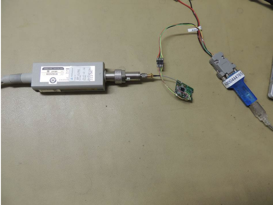
Photograph 2: Set-up for Radiated Emission of Transmitter, MHz Band