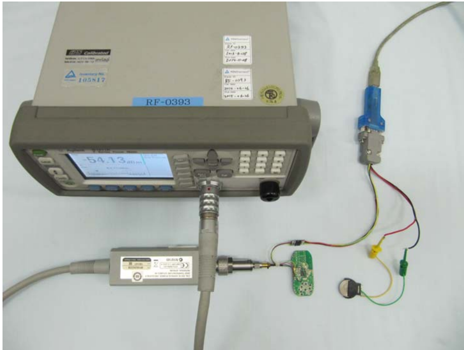
Photograph 1: Set-up for RF Conducted Power at Antenna Port