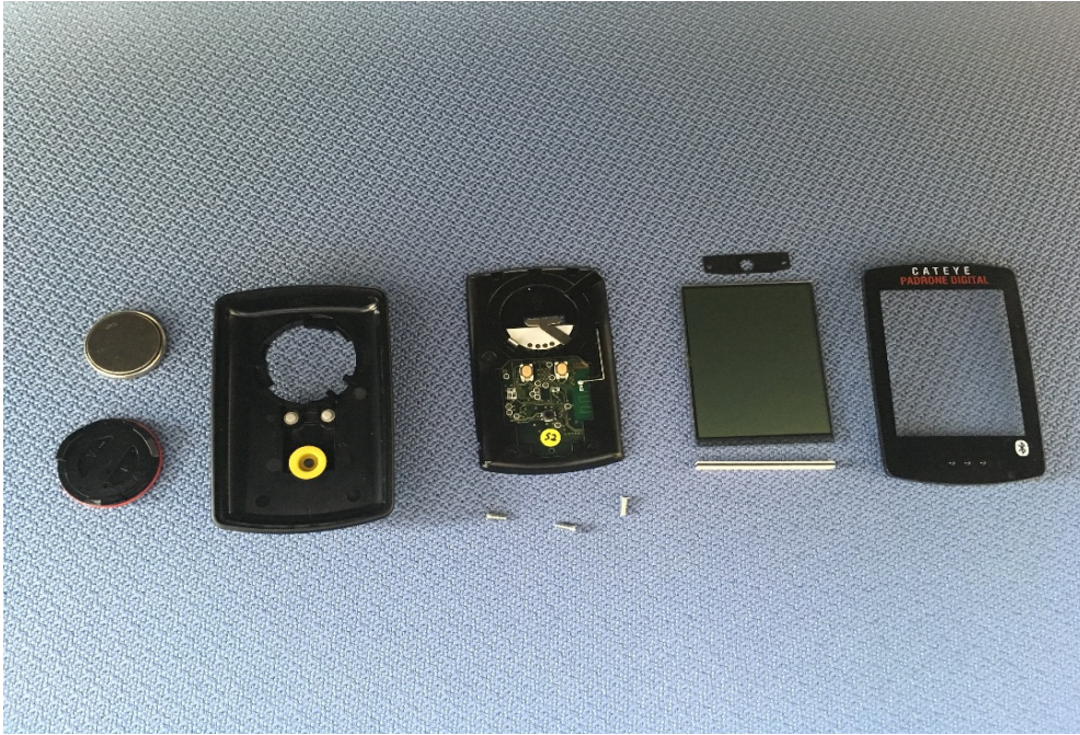
PCB side 1