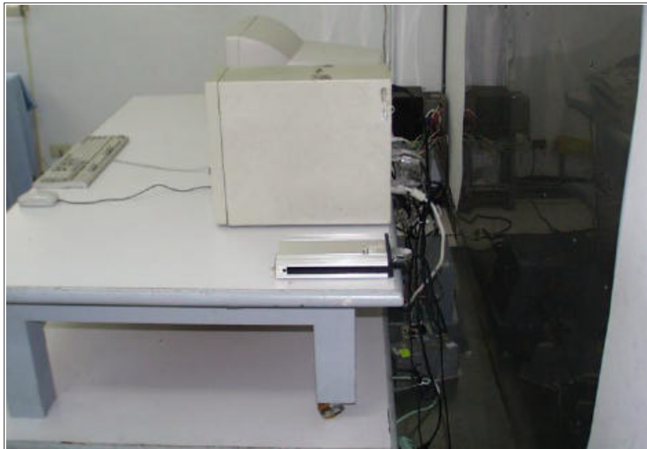
Conducted Emission Setup Photos (Worst Emission Position)