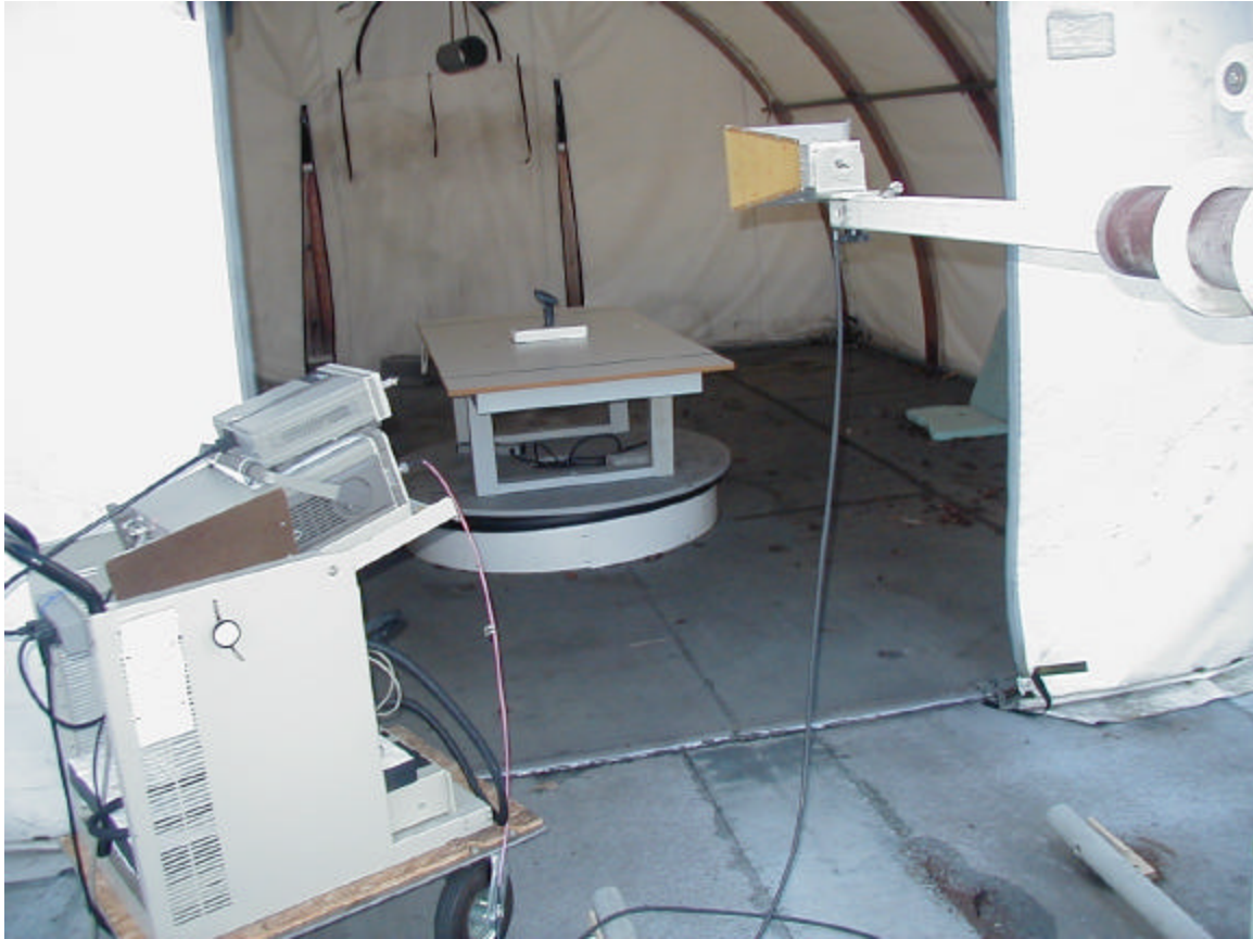
Radiated Emission (1 of 2)