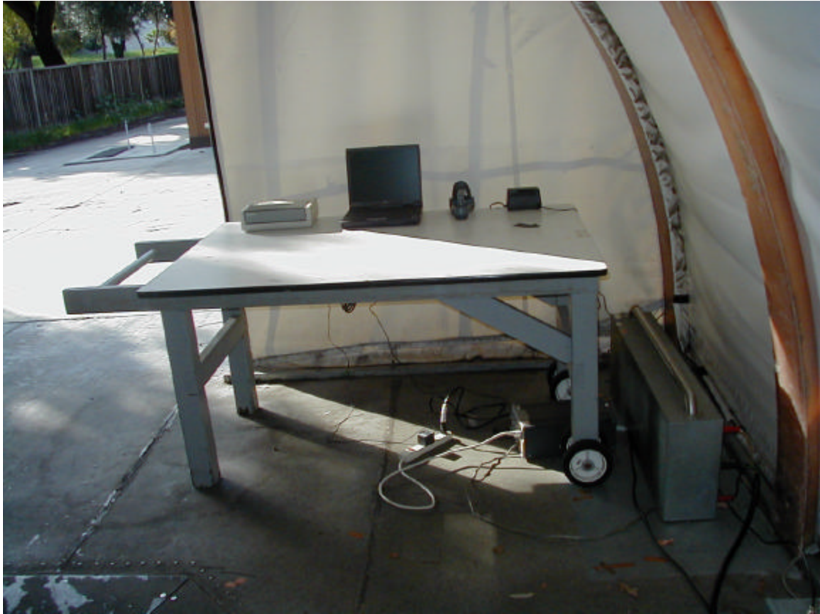
AC conducted Emission (1 of 2)