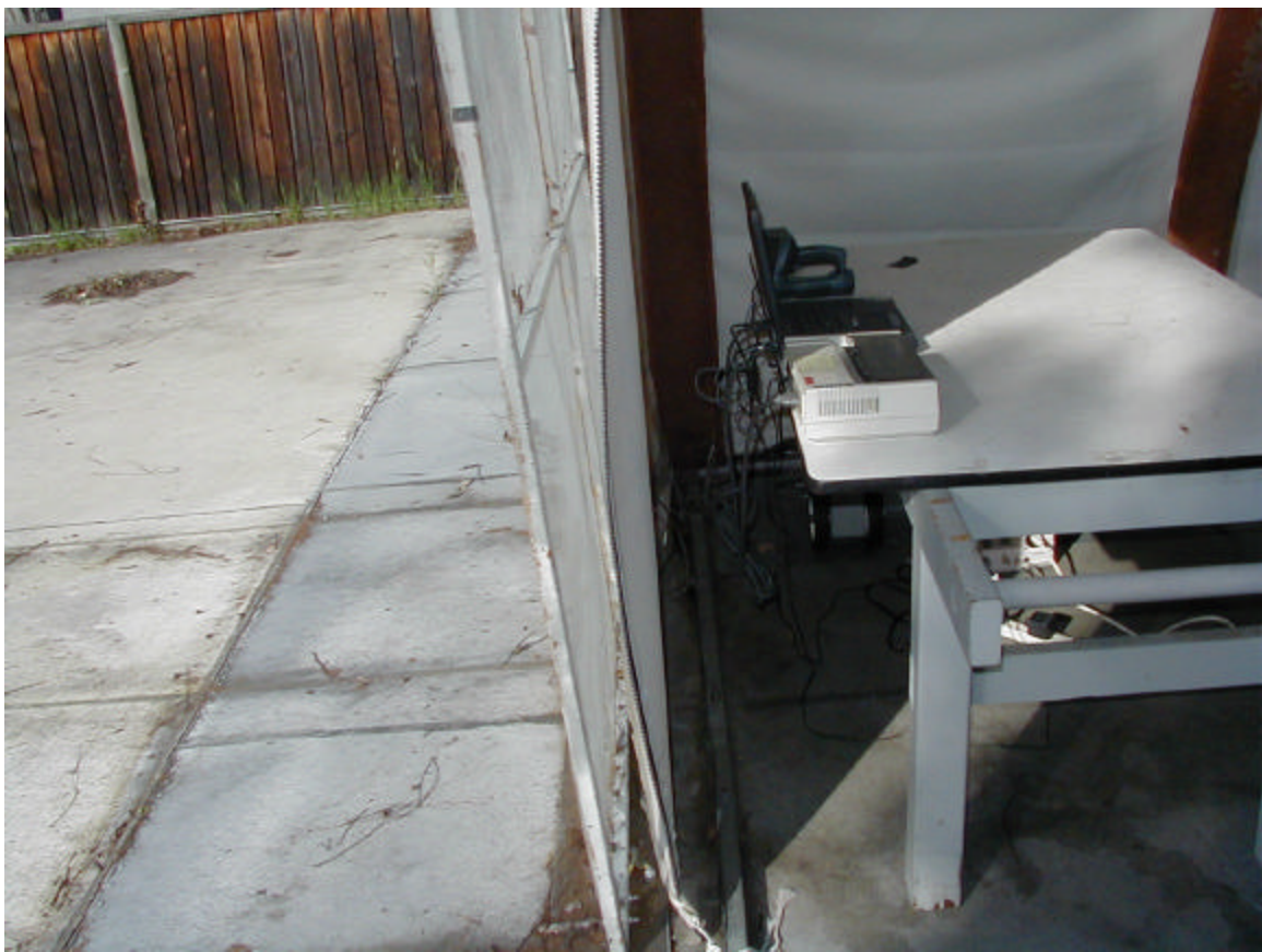
AC conducted Emission (2 of 2)