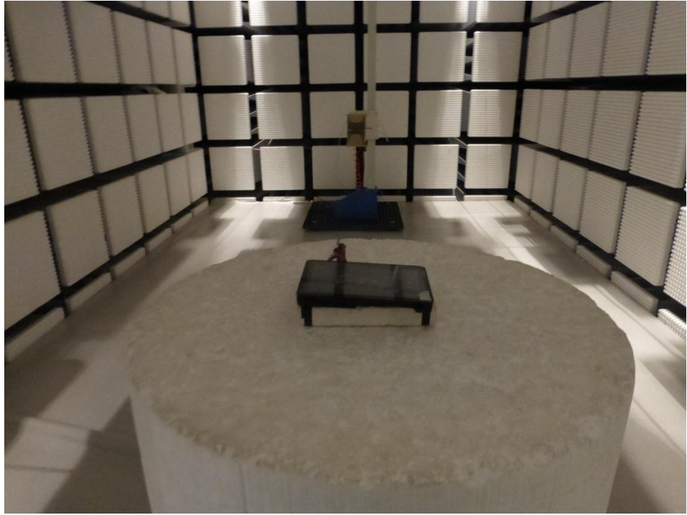
Radiated emission above 1GHz