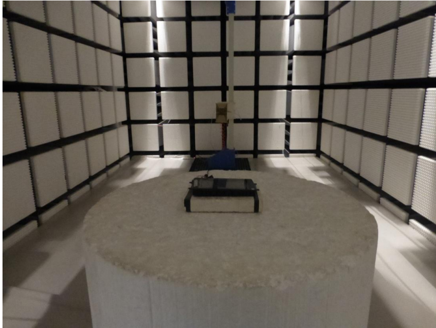
Spurious emission above 1GHz