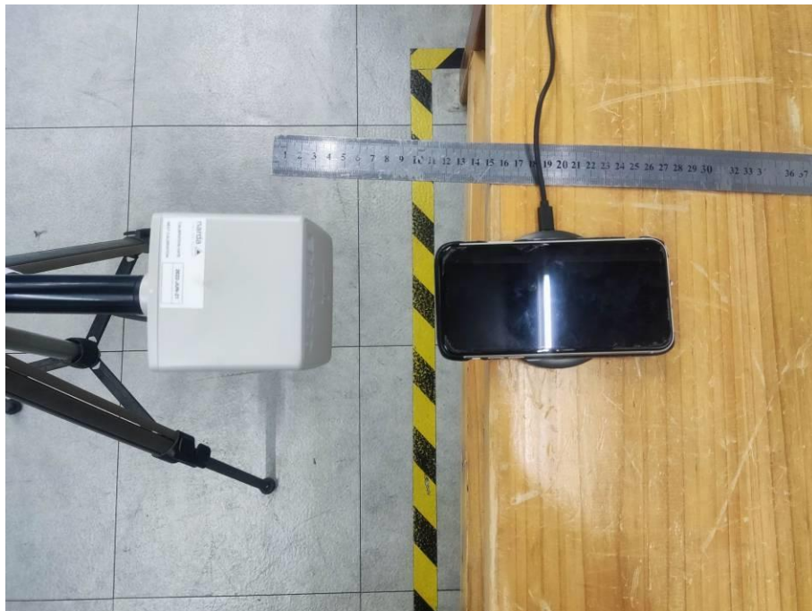
Test Position B-15cm from the edge of EUT to the geometric center of the probe