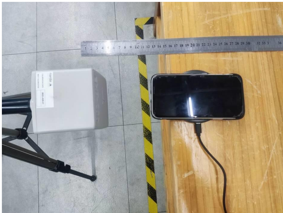
Test Position D-15cm from the edge of EUT to the geometric center of the probe