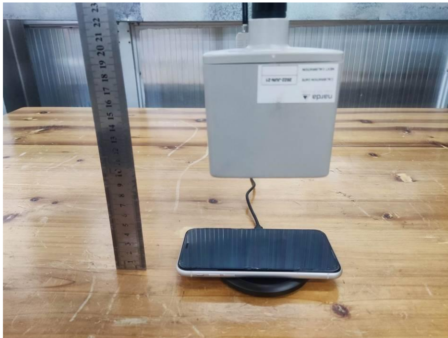
Test Position E-15cm from the edge of EUT to the geometric center of the probe