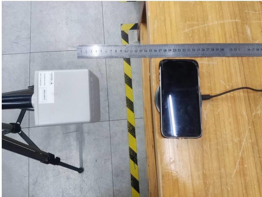
Test Position A-15cm from the edge of EUT to the geometric center of the probe