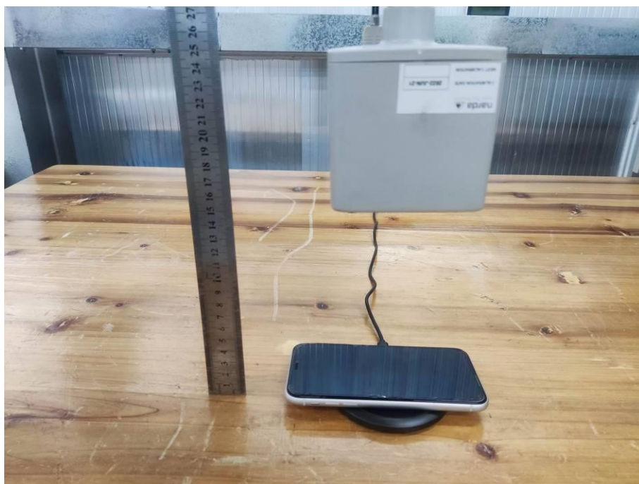
Test Position F-20cm from the edge of EUT to the geometric center of the probe