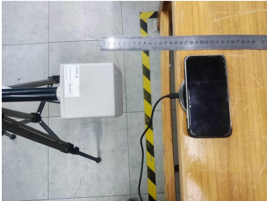
Test Position C-15cm from the edge of EUT to the geometric center of the probe