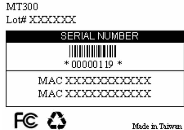
Box Side Label