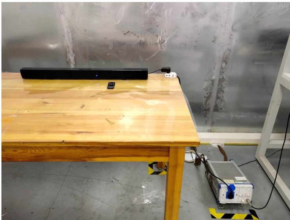
AC Conducted Emission of charge from power adapter mode