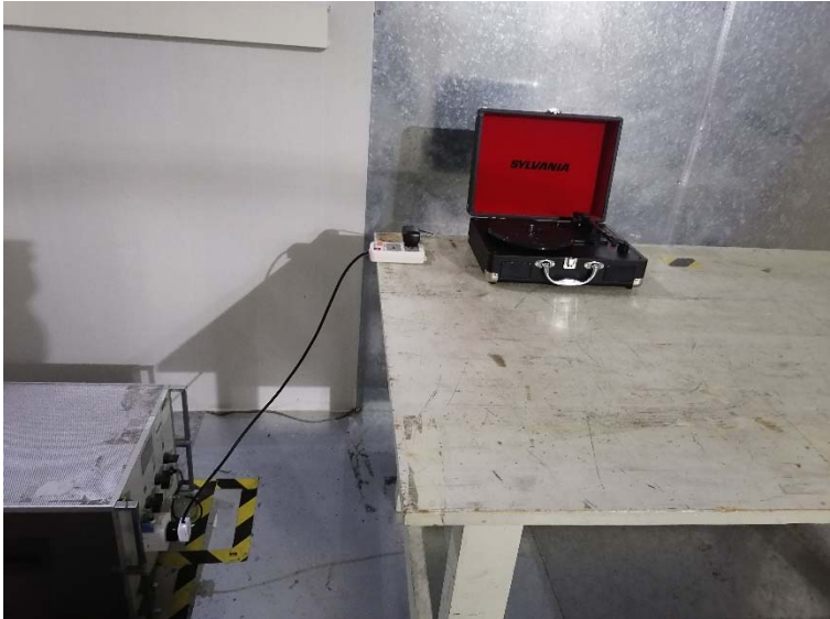
Radiated Emission Photo 1