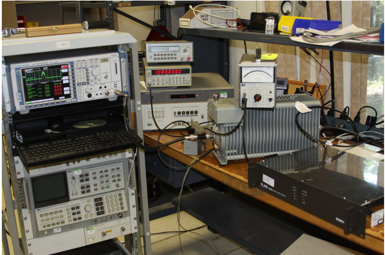
SPURIOUS EMISSIONS AT ANTENNA