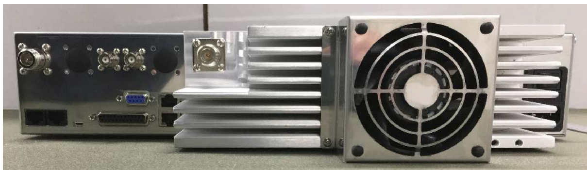
Figure 3. External Rear View.