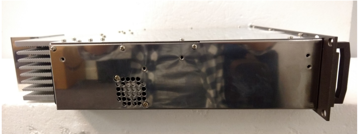
Figure 4. External Left View