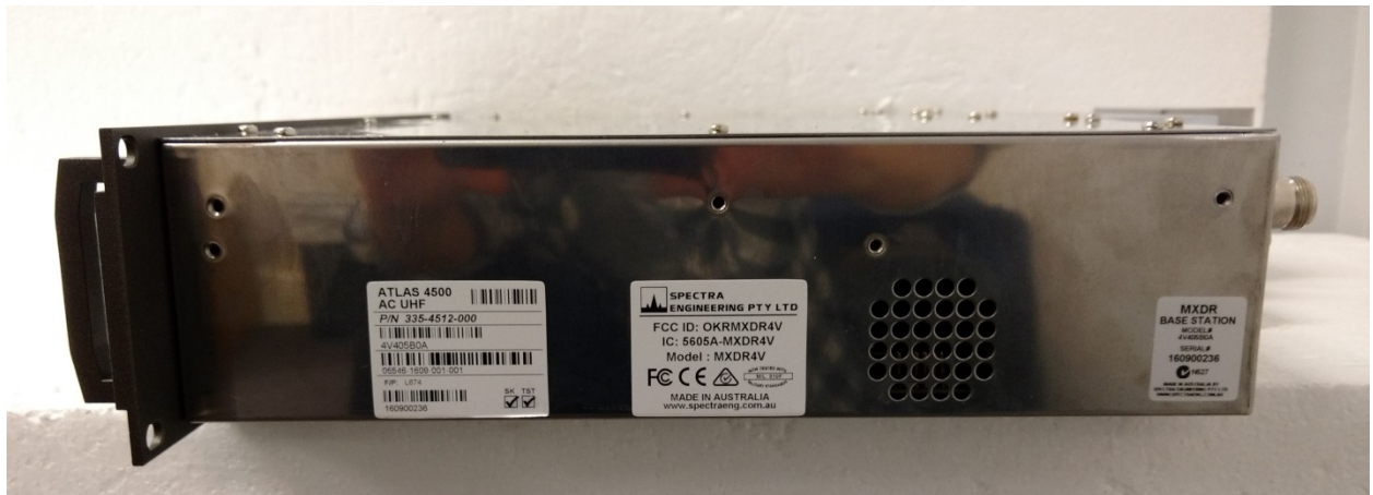
Figure 5. External Right View