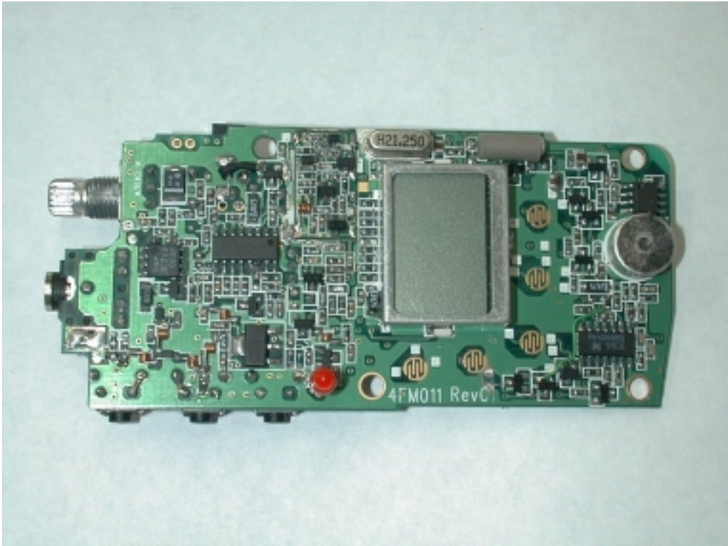
PCB Component Side