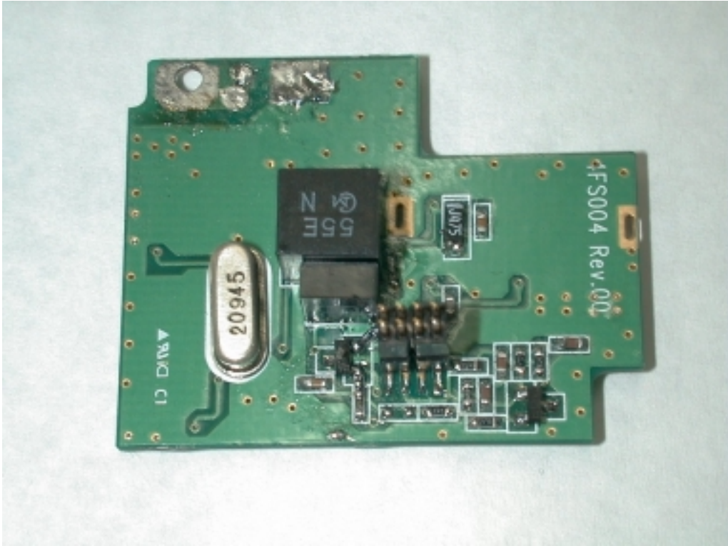
PCB WX Track Side