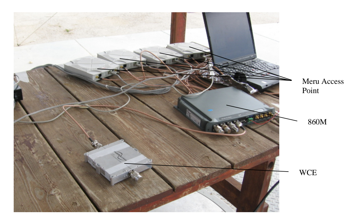
Closeup Radiated Emission