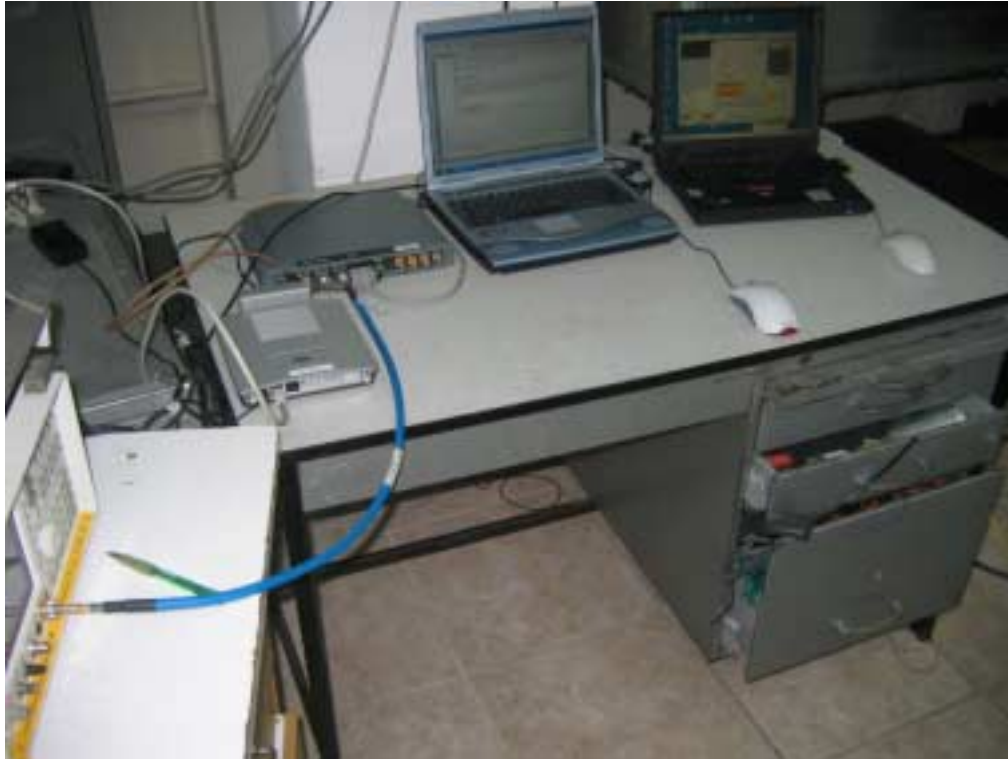
Photograph No.1 Peak output power, power spectral density, occupied bandwidth Measurements at RF antenna connector test setup