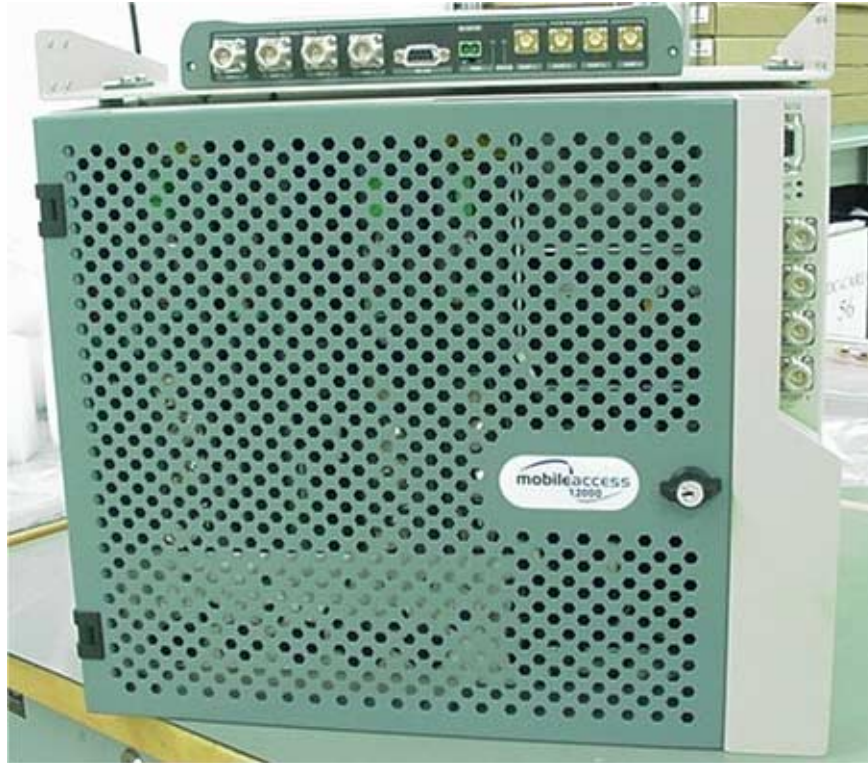
Photograph No.1 MA2000 RHU-iDEN/SMR front view with MA1000