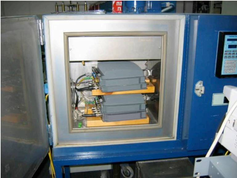
Photograph 1.1.1 Frequency stability test setup