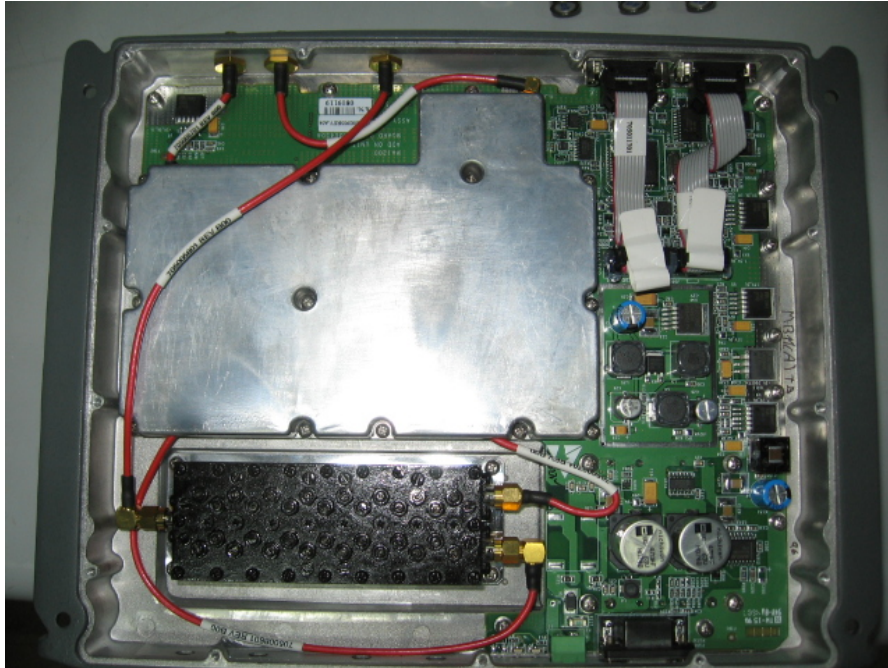
PCB With Shield In Cover