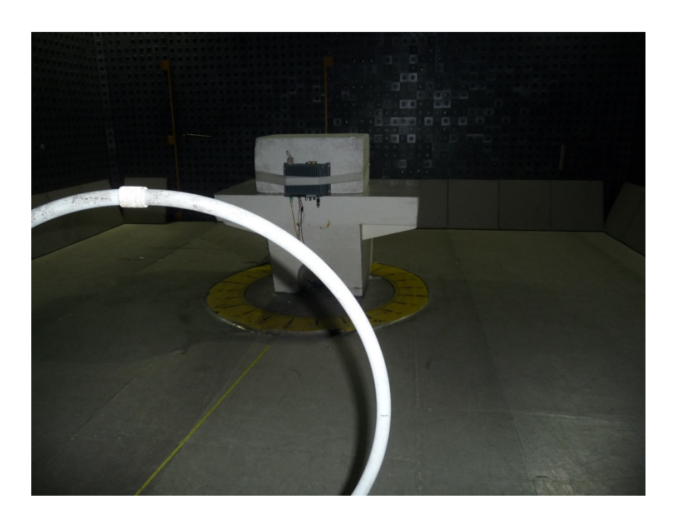
Page 3 of 5