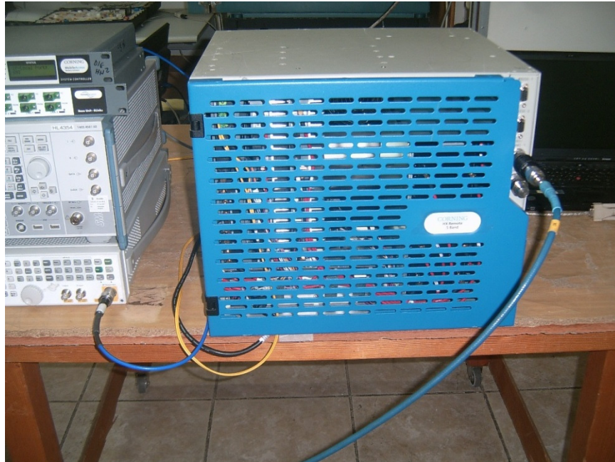
Photograph No.1 Mean output power, AGC threshold level, spurious emissions, occupied bandwidth measurement setup