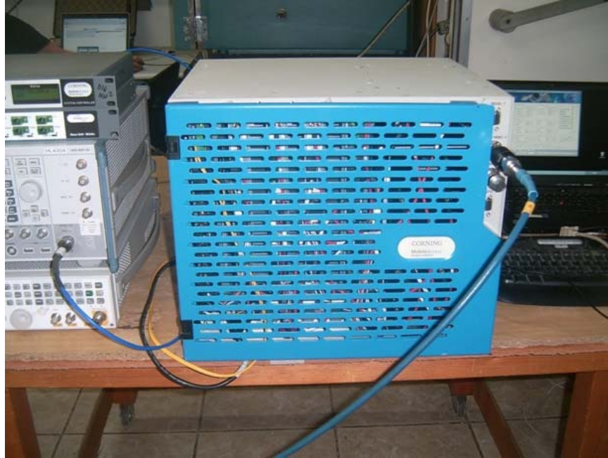
Photograph No.1 Mean output power, AGC threshold level, spurious emissions, occupied bandwidth measurement setup