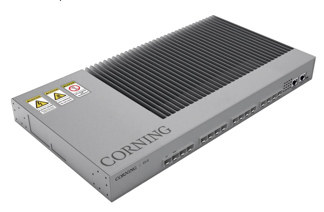
The E62-E3-O — Expansion Unit is a standard 19-inch 1U rack-mounted shelf, which serves as the interface between the Primary A3 and the Remote Unit for the capacity expansion of system.