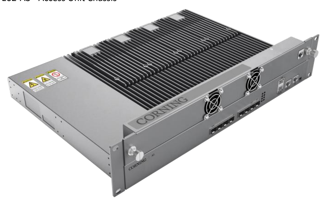
The E62-A3 – Access Unit Chassis is a standard 19-inch 2U rack-mounted shelf (1U fan unit included), which serves as the host for Everon™ 6200. The E62-A3 provides coupling access to radio signal sources of multi-operator, multi-system, and multi-band, forming digital optical signals and distributing static capacity distribution to fiber-connected other type devices. One A3 supports up to eight optical interfaces connected to E3s (Expansion Unit) or N3RUs (Remote Unit).

This document describes the installation procedure for the E62-N3 remote unit.