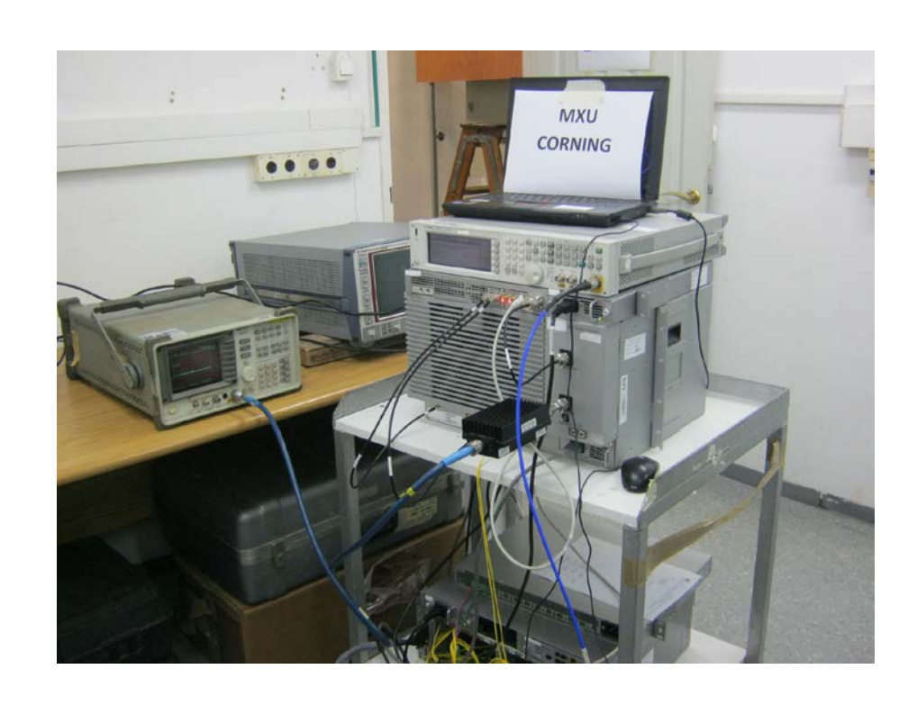
Conducted Emission From Antenna Port Tests