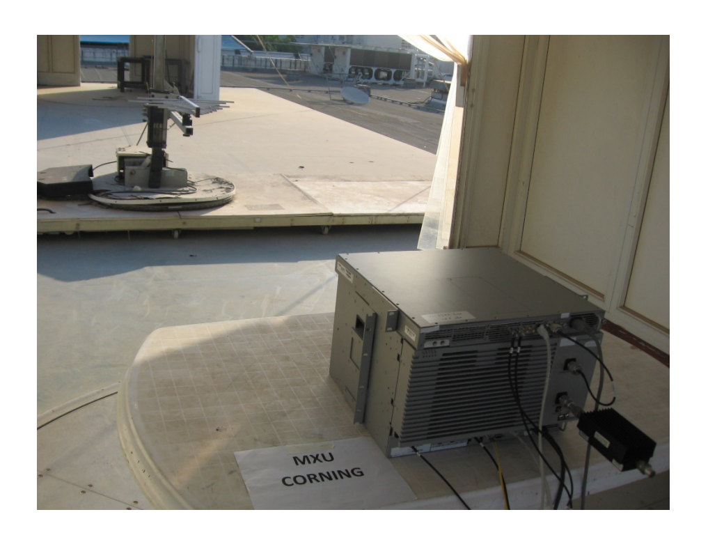
Radiated Emission Test - 200-1000MHz