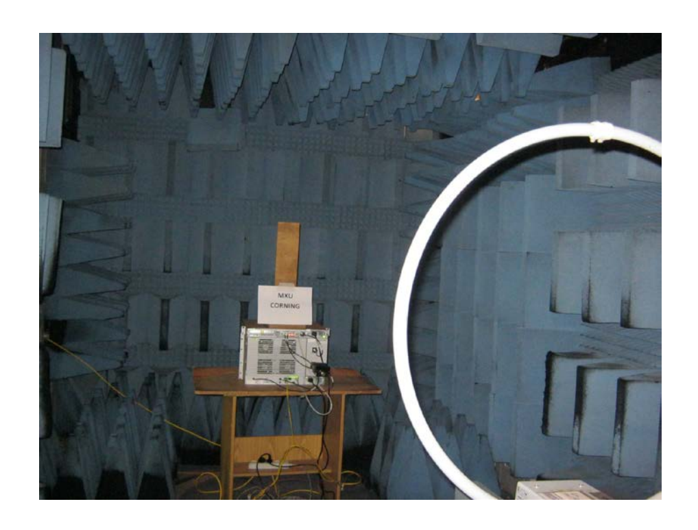
Radiated Emission Test - 0.009-30MHz