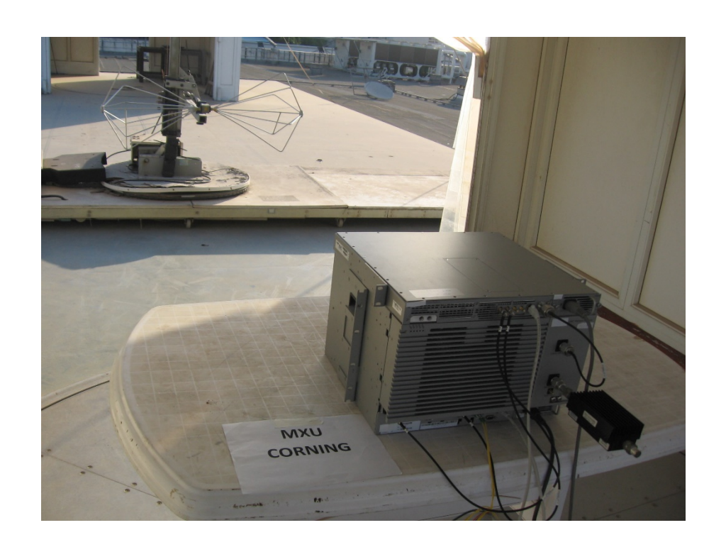
Radiated Emission Test - 30-200MHz