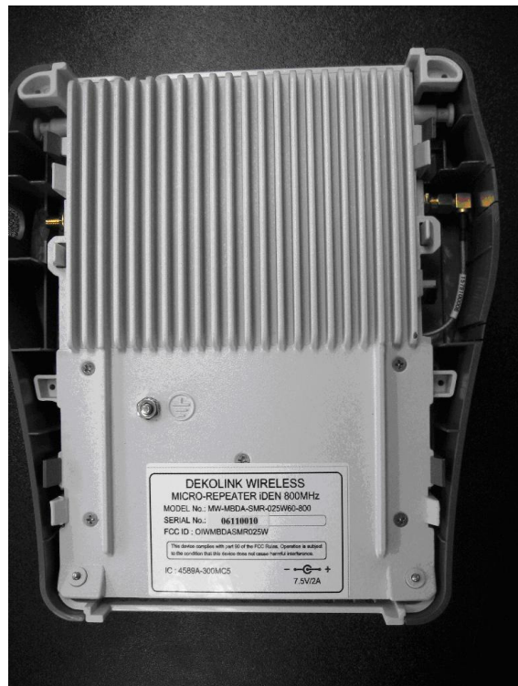
back side view