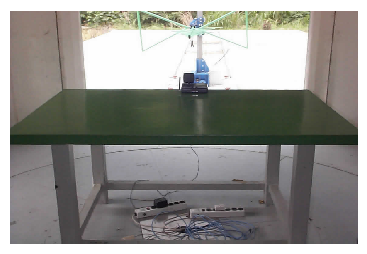
Front View of Radiated Emission Test (Mode 1)