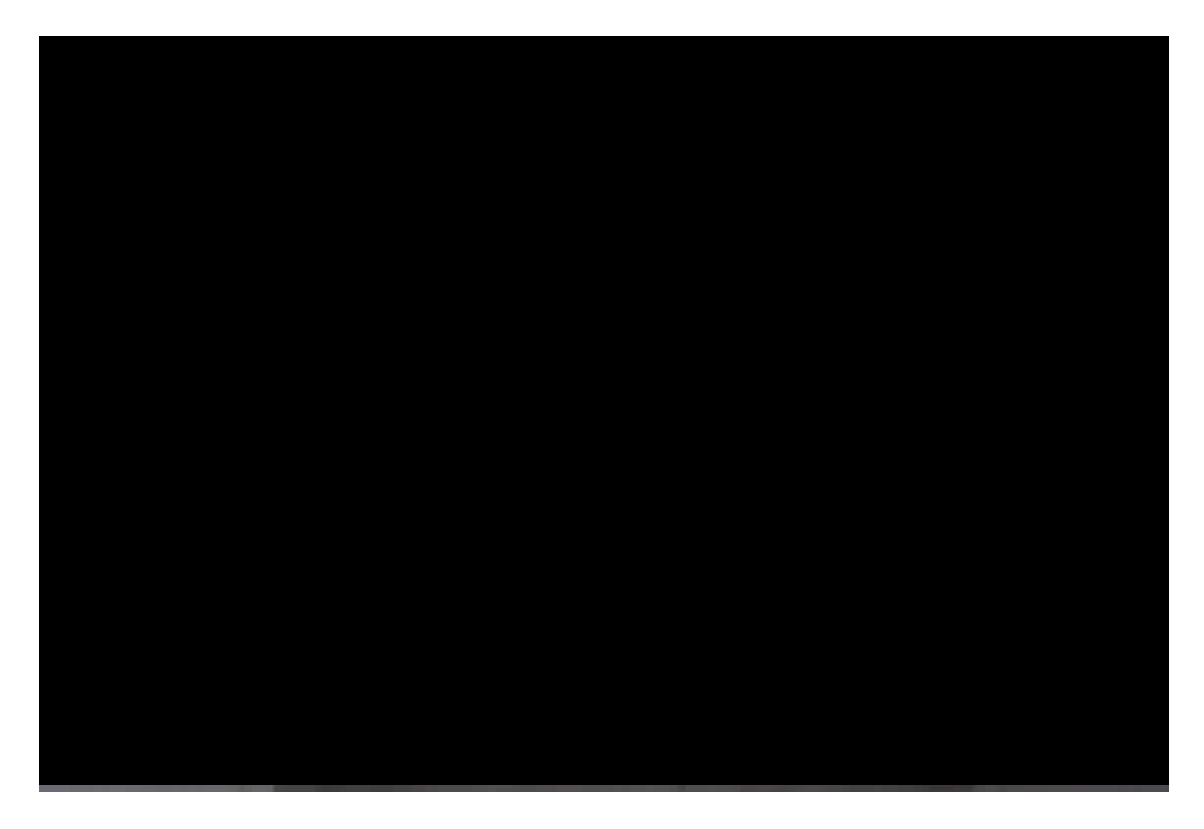
Back View of Radiated Emission Test (Mode 1)