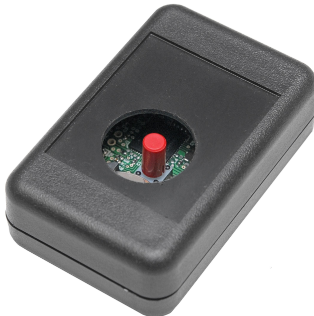
HH WITH COVER ON