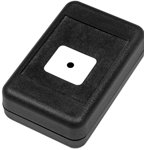
HH WITH PUSH BUTTON LABEL ON