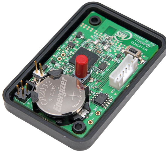
HH IN BOX