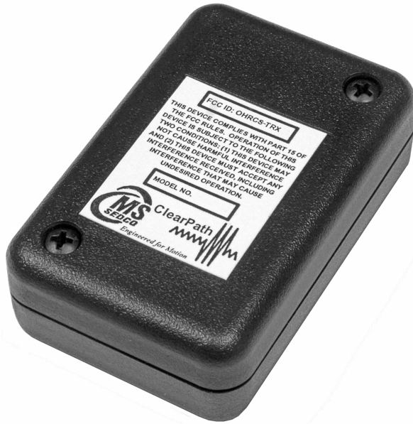
HH WITH FCC LABEL ON BACK SIDE OF CASE