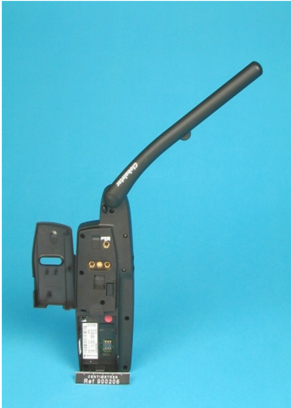
Photograph Three: Rear view of Ericsson Jekyll submitted for testing with antenna in deployed position and connector blanking panel removed.