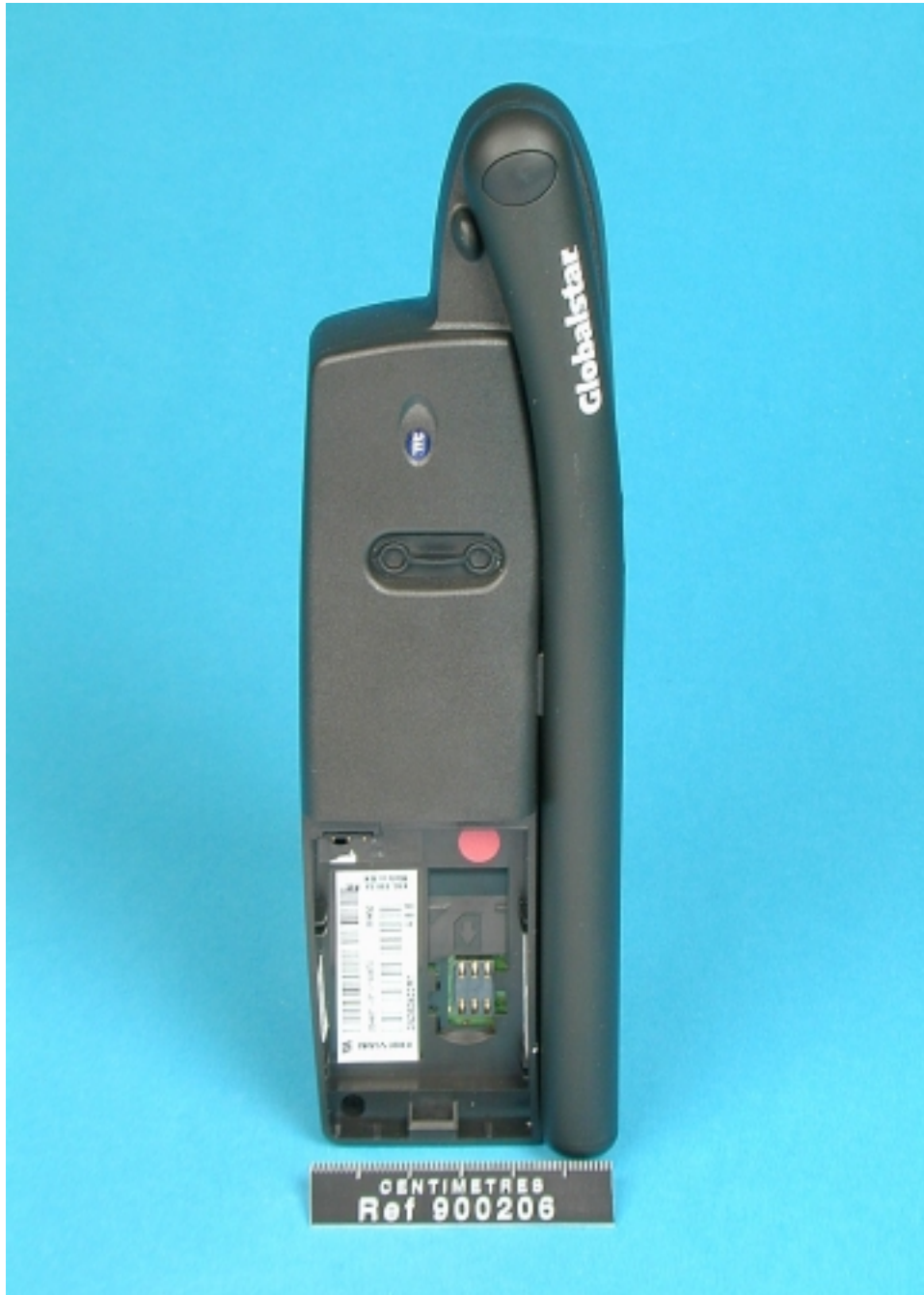
Photograph Two: Rear view of Ericsson Jekyll submitted for testing with antenna in stored position.