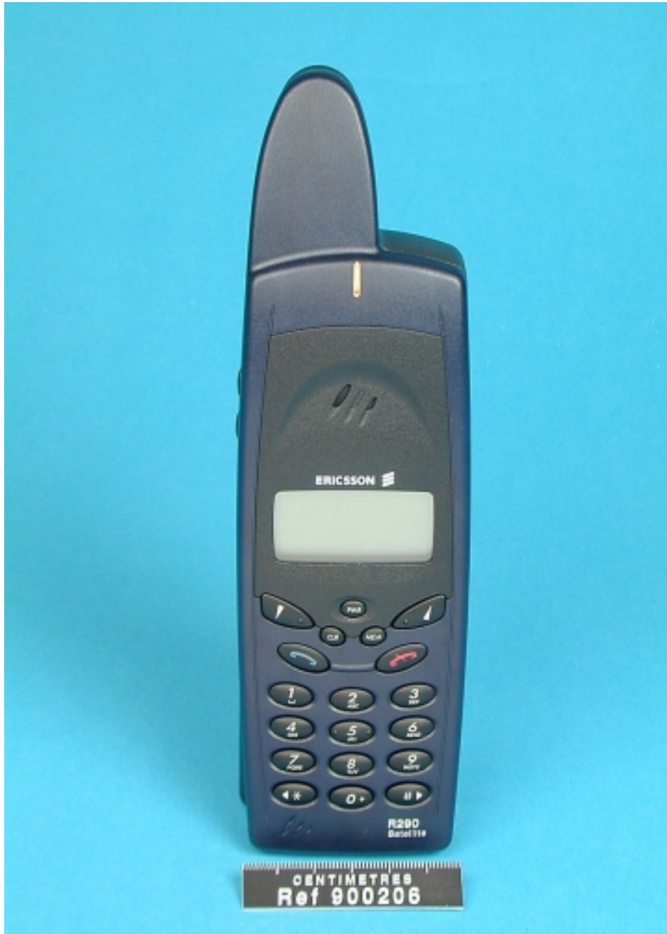
Photograph One: Front view of Ericsson Jekyll submitted for testing with antenna in stored position.