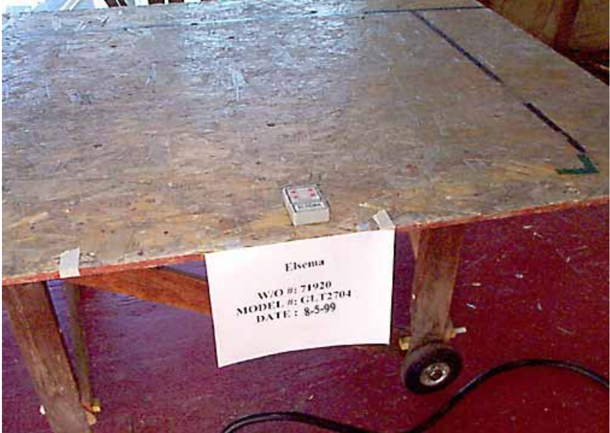
Radiated Emissions - Front View