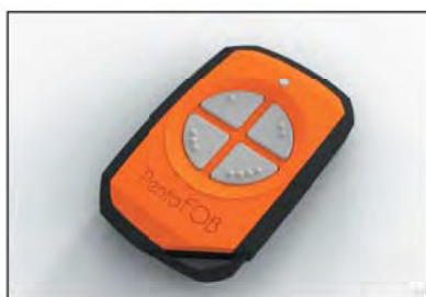
Case Black Upper Orange

The PentaFOB® is an extremely versatile remote control that can be customized through a range of configurations and colours to suit your needs.