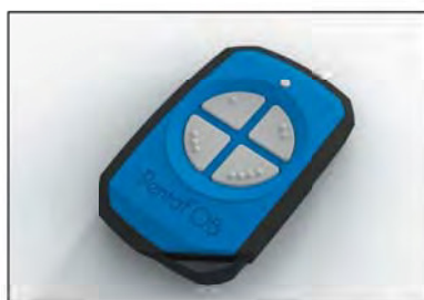
Case Black Upper Blue