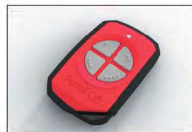
Case Black Upper Red

Choose from a range of colour options. Mix and match! If you require a custom Pantone® colour please contact us for more information