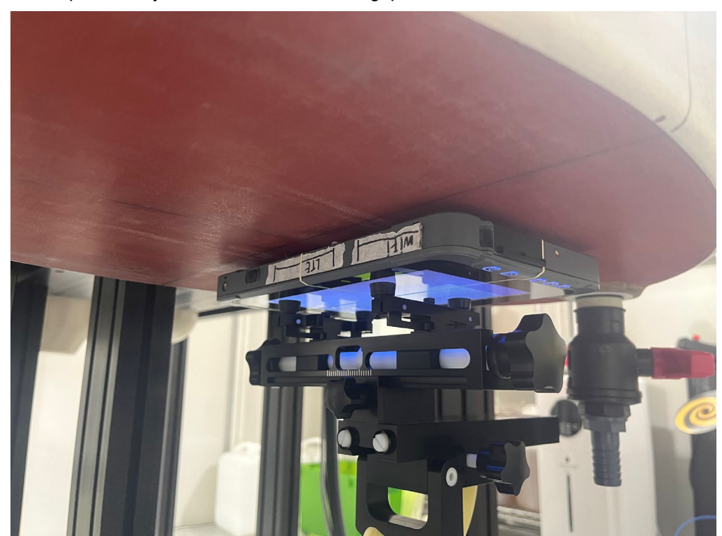
Description: Body Left Position with 0mm gap

Description: Body Back Position with 0mm gap