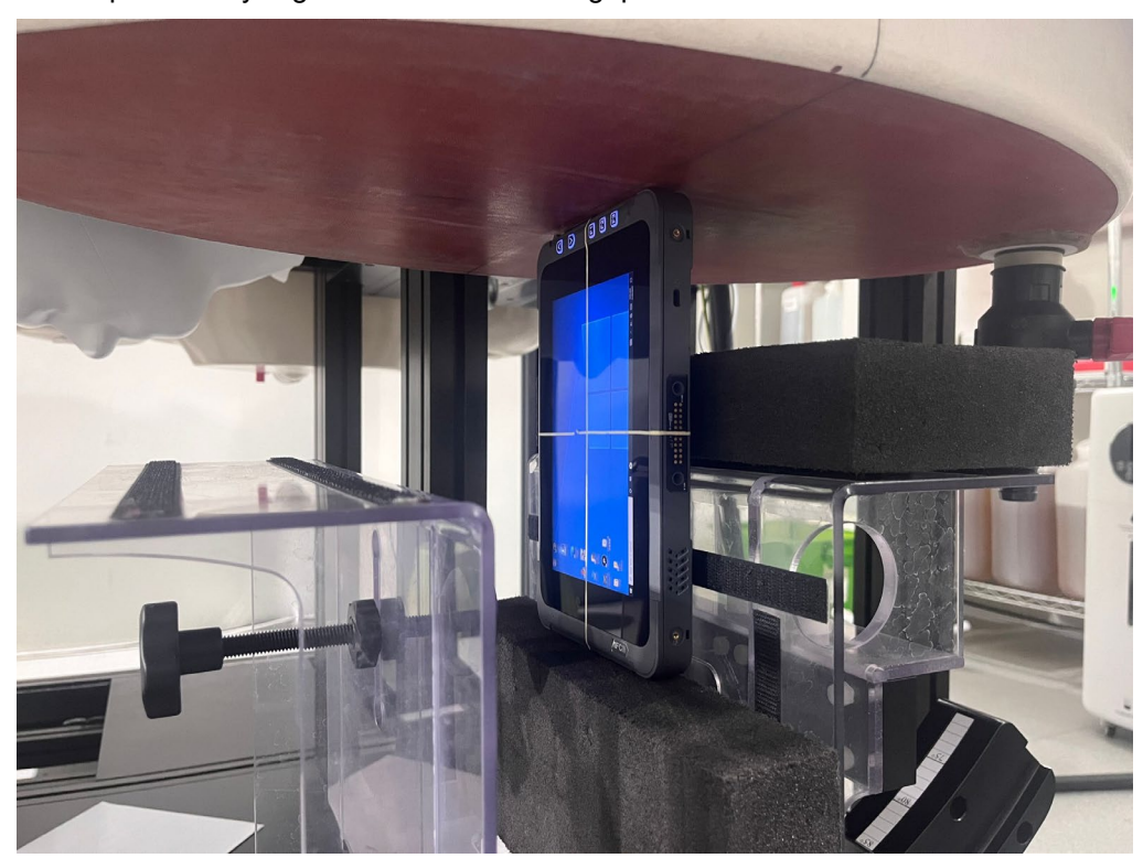
Description: Body Top Position with 0mm gap

Description: Body Right Position with 0mm gap