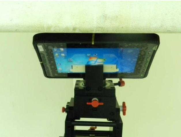
Curved surface of Edge2, Test Separation 40 cm