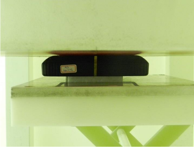
Bottom Face, Test Separation 0 cm