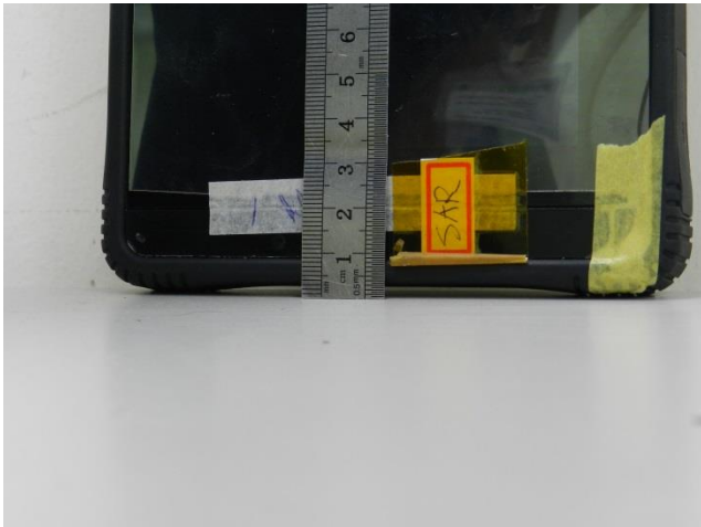
Edge1 protrusions between the outer housing and Edge2 protrusions between the outer housing and a flat phantom is < 5 mm