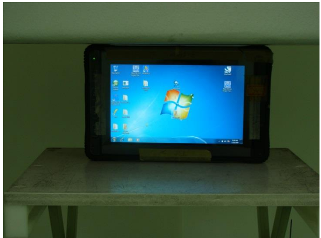
Edge4, Test Separation 0 cm