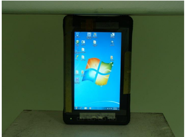
Edge1, Test Separation 0 cm