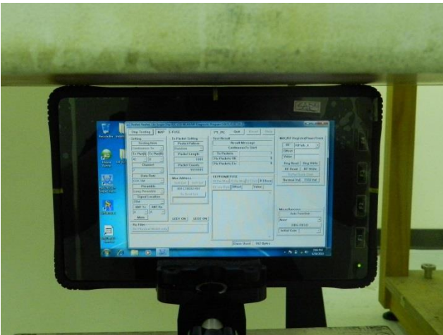
Edge2, Test Separation 0 cm