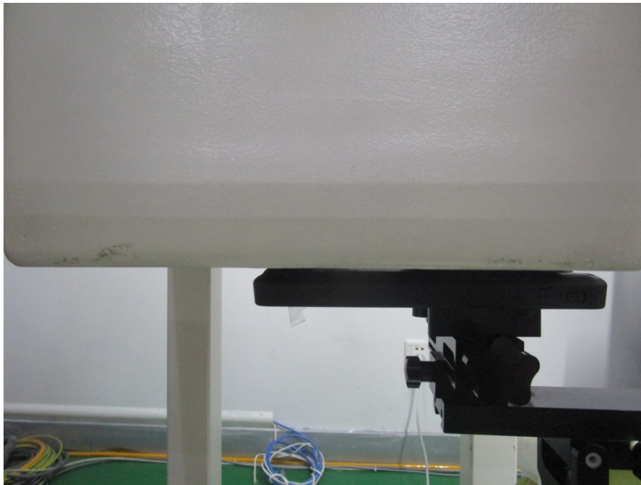
Body Top Setup Photo(0mm)