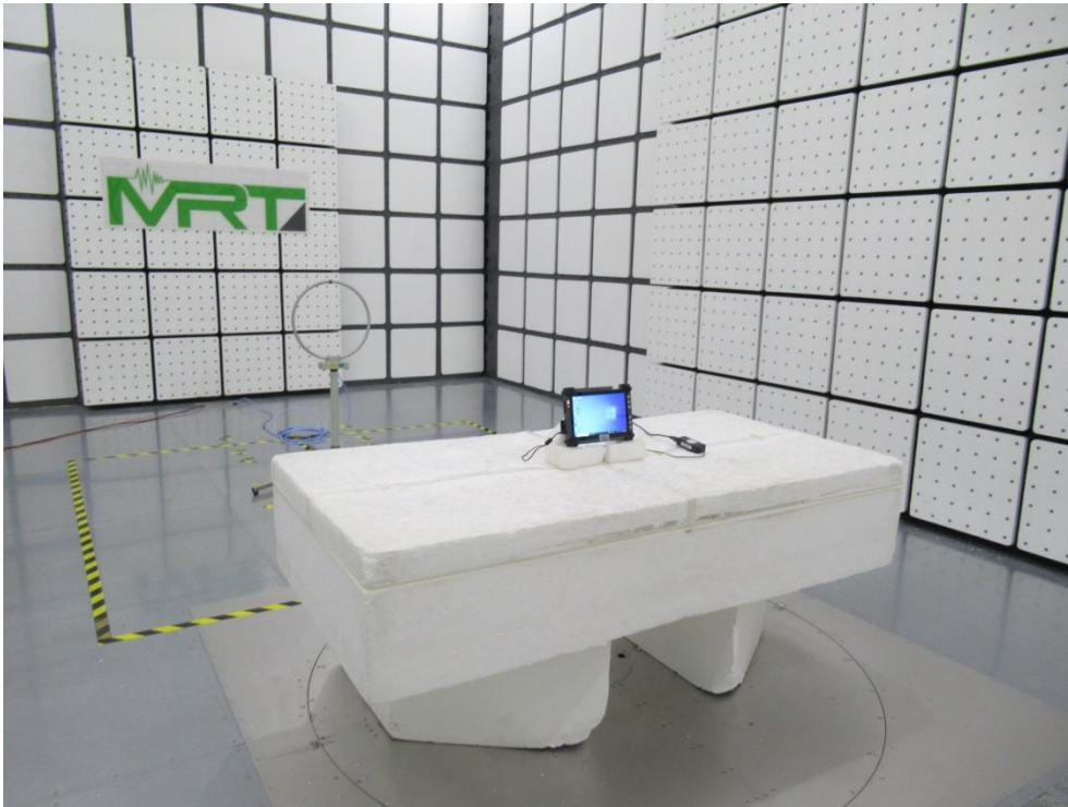
Description: Radiated Emission Test Setup for 30MHz ~ 1GHz