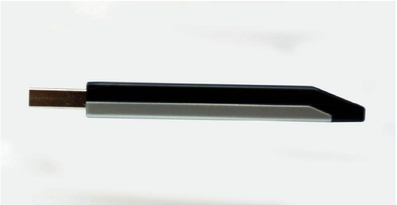
NGP Left side