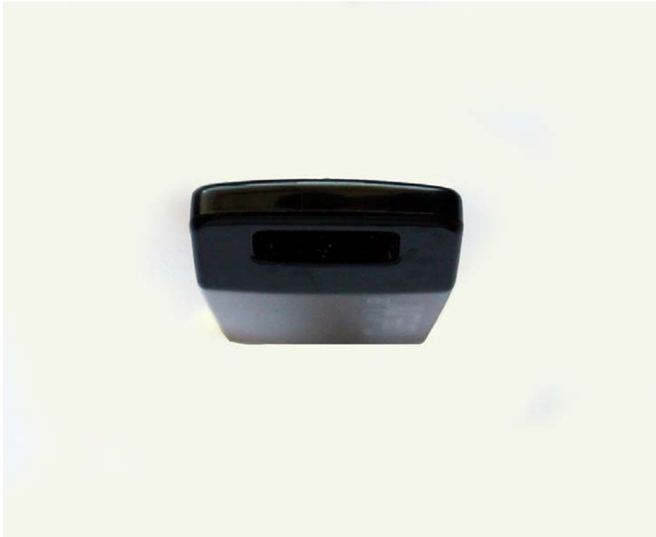
Carelink USB 2.4 Front