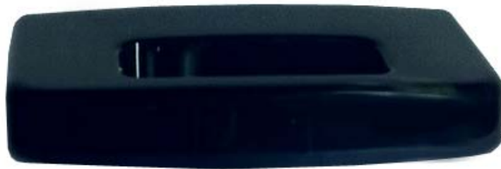
NGP Back side