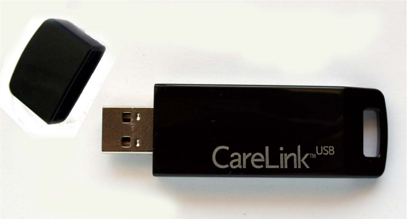
Carelink USB 2.4 Top