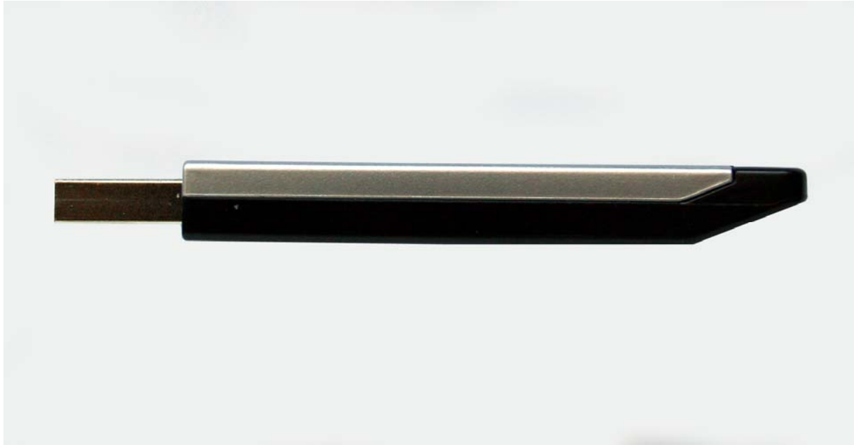
NGP Right side