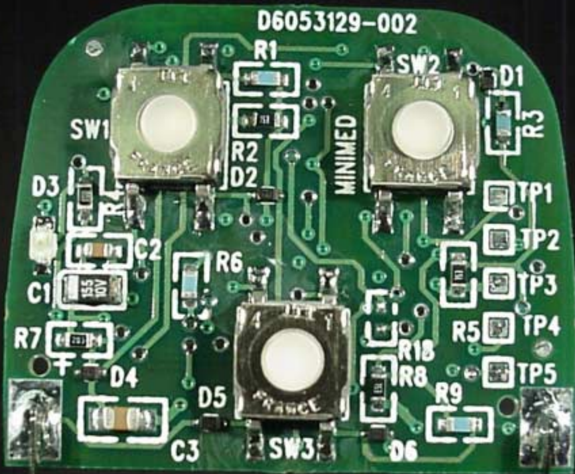
BACK TRANSMITTER BOARD