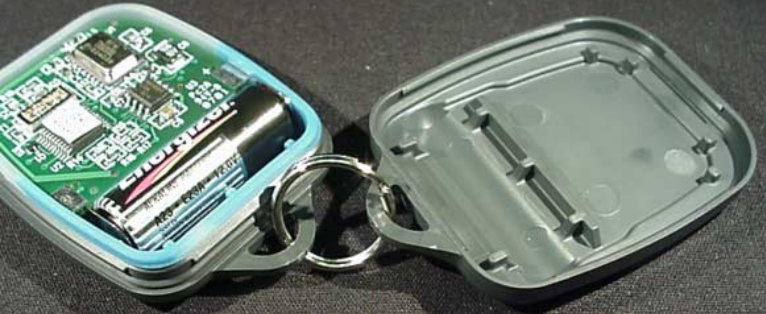
INSIDE WITH BOARD AND BATTERY