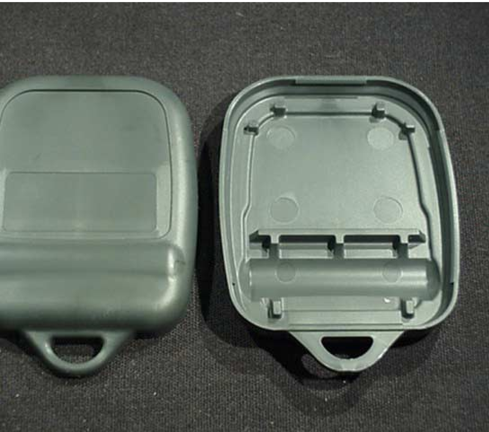
INSIDE AND BACK