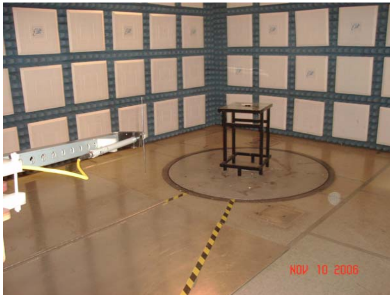
Test Set-up for Radiated Emissions Vertical Polarity