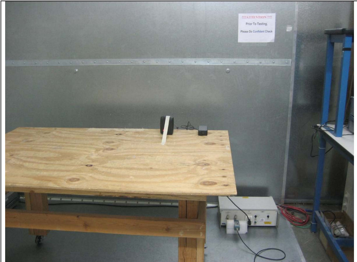
AC Line Conducted Emission Test Setup – Front View