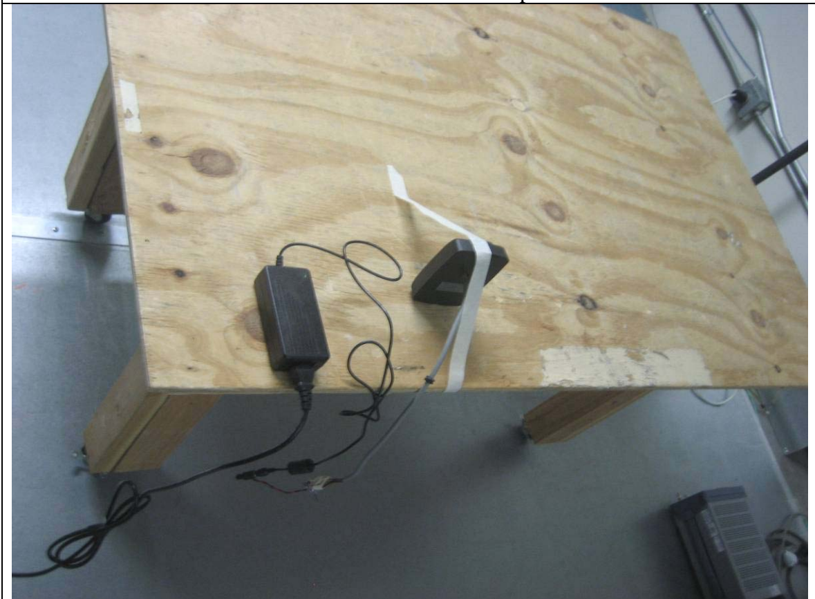
AC Line Conducted Emission Test Setup – Rear View